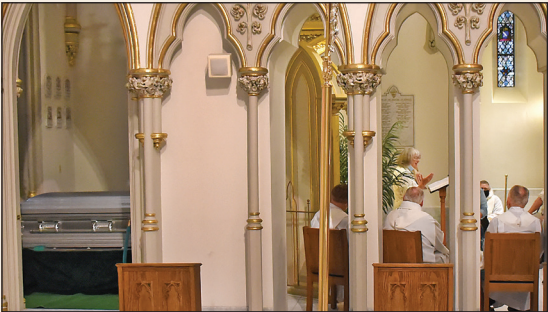
Bishop Joseph Burke laid to rest at St. Joseph Cathedral Page 6-7